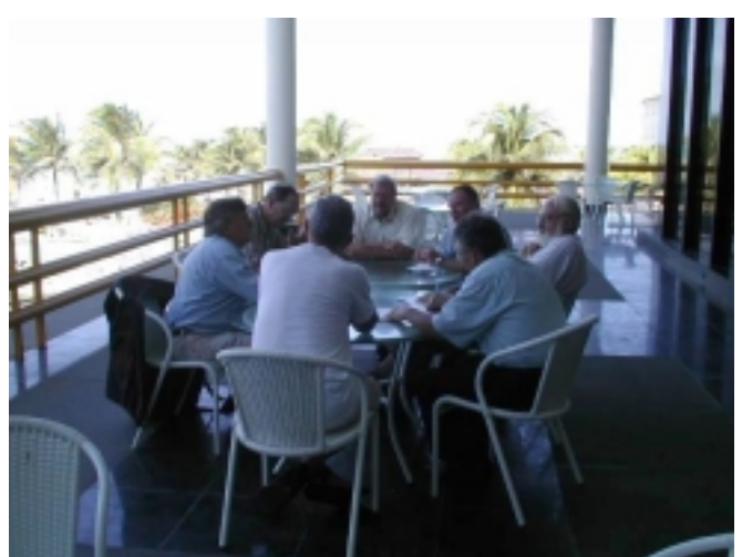
IT STAR meets during IFIP GA in Natal, Brazil

The 2001 meeting was convened in Portoroz under the auspices of IFIP with the participation of representatives from Austria, Italy, Hungary, Slovenia and IFIP. The meeting adopted a Statement to establish an IT STAnding Regional (IT STAR) Committee. In September 2001, during the IFIP General Assembly in Brazil, some of the founding participants met to prepare an action plan intended to be considered and adopted during a forthcoming IT STAR meeting on 21 September in Como, Italy.